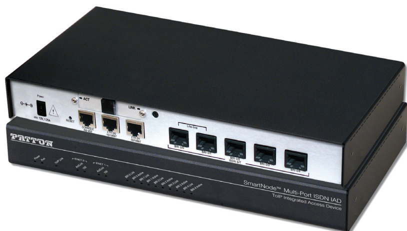
SmartNode 4650 with G.SHDSL.bis

Visit www.patton.com for more information.